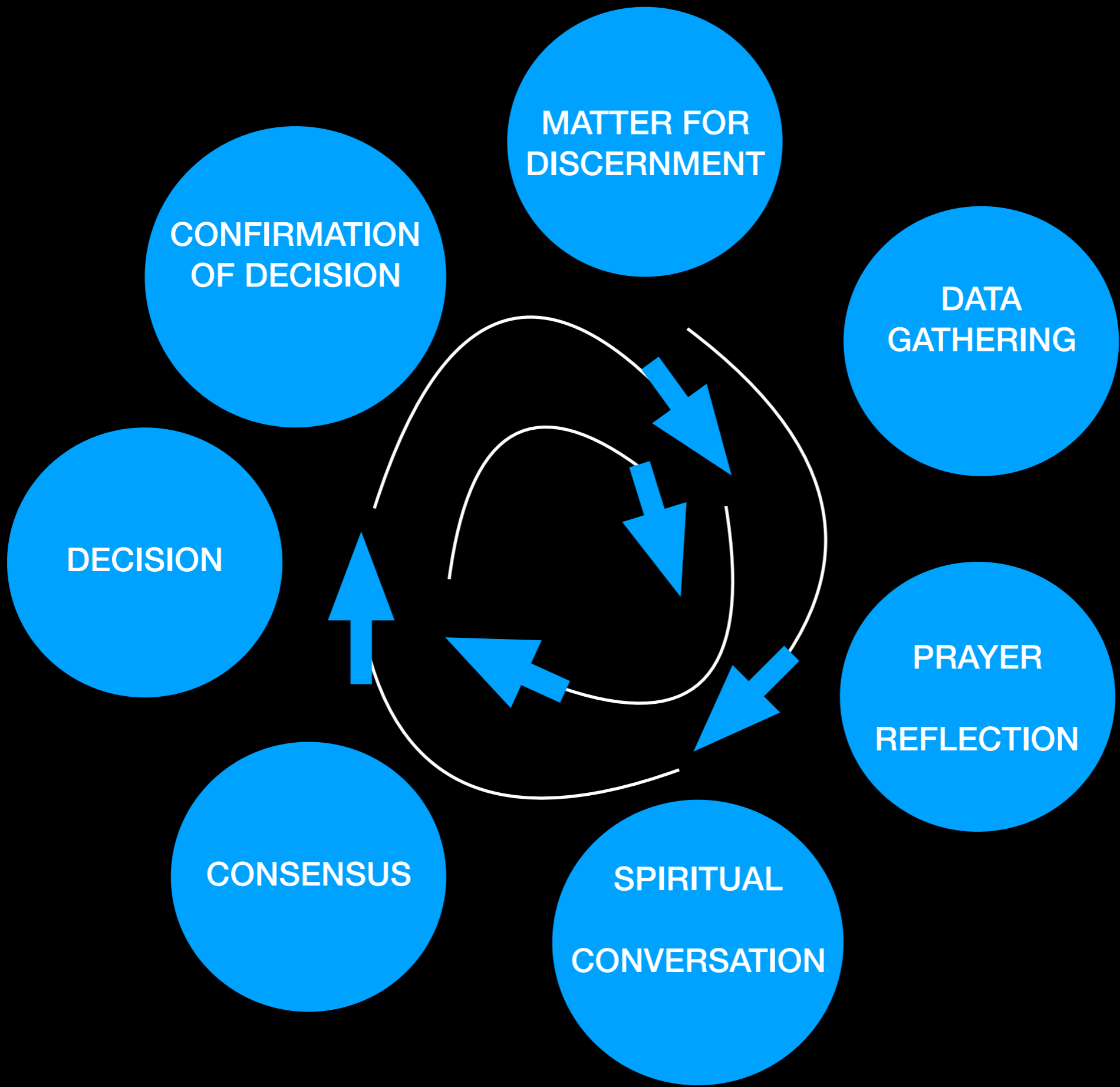
OVERVIEW OF THE PROCESS OF COMMUNAL DISCERNMENT